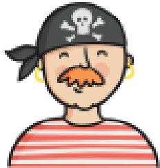
Pirate Jack's Treasure