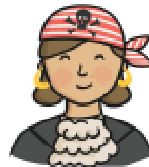
Pirate Jenny's Treasure

Challenge: What fraction of the treasure does Pirate Jenny get?