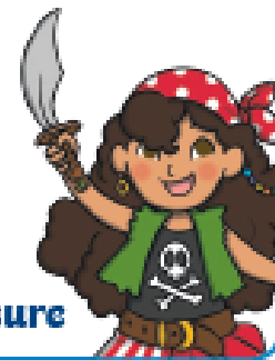
Pirate Jenny's Treasure

Challenge: What fraction of the treasure does Pirate Jenny get? _____