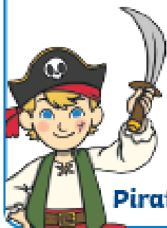
Pirate Jack's Treasure